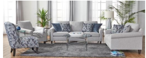
LH10650 with LH1525JHS