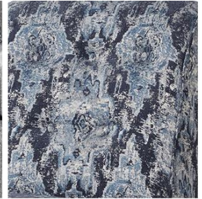
JACKSON HOLE SAPPHER (JHS)