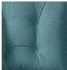
WEXLER SPLASH (WS)