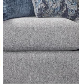
BRAVO PEPPER (BP)