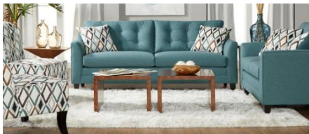
LH11900 with LH1525BS