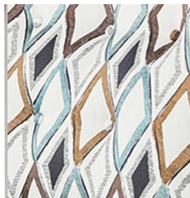
BRADY SKY (BS)